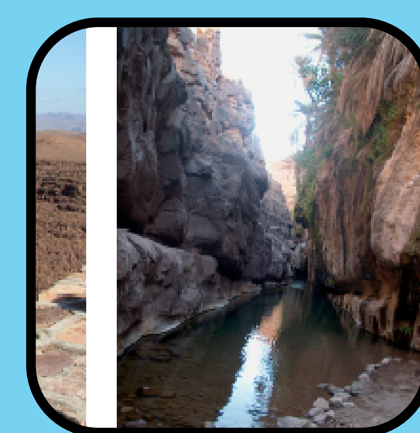
GORGES D'ASSIF FENFEL