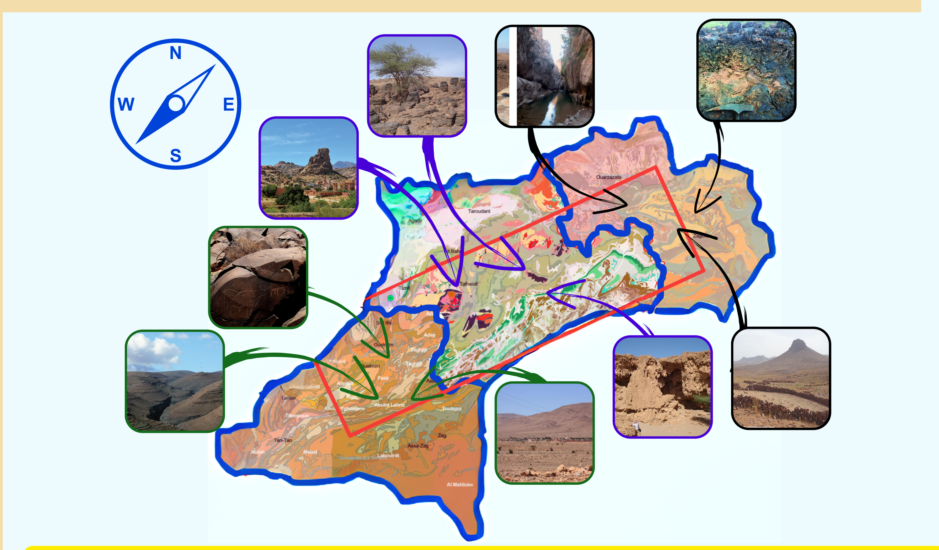
An inventory of over 70 remarkable sites across the territory

"Territory, because without history, there is no future, and because climate change and the lack of consideration for inter-regional watershed territories have led to water stress. Territory, because in perfect symbiosis with their geology, and The geography of these places,