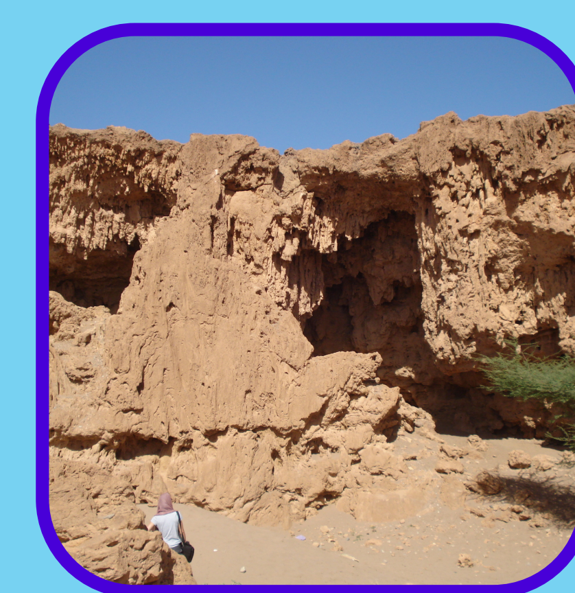
GROTTES DE MESSALITE